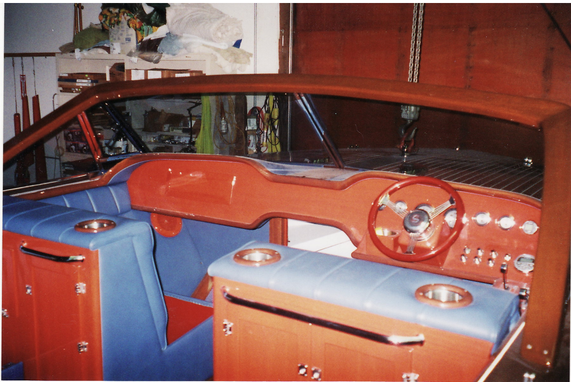
The cockpit of a 28 footer with twin engines!