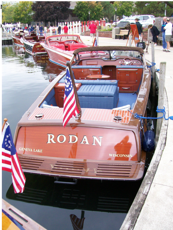
It is now named "Rodan"!