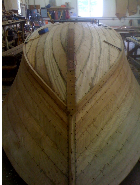
A new 23 footer under construction!

The same hull finished and at the 2009 Blackhawk Show in Fontana, Wis.