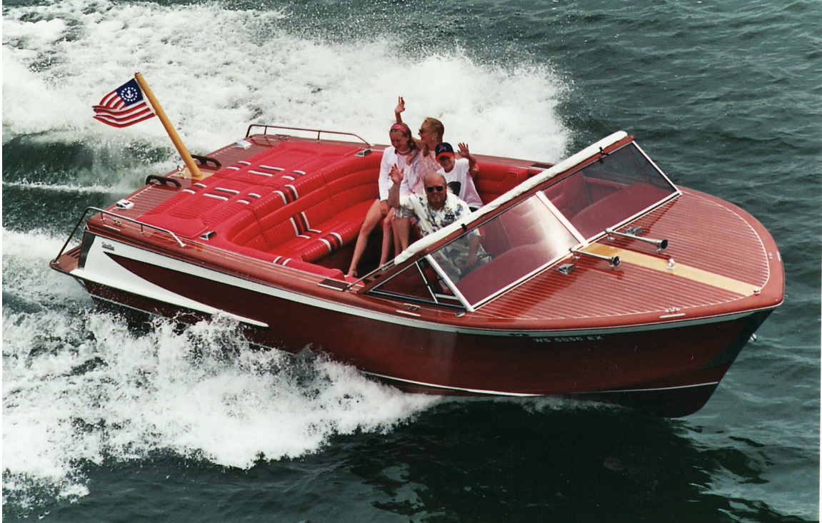
A 26' Streblow on Geneva Lake!