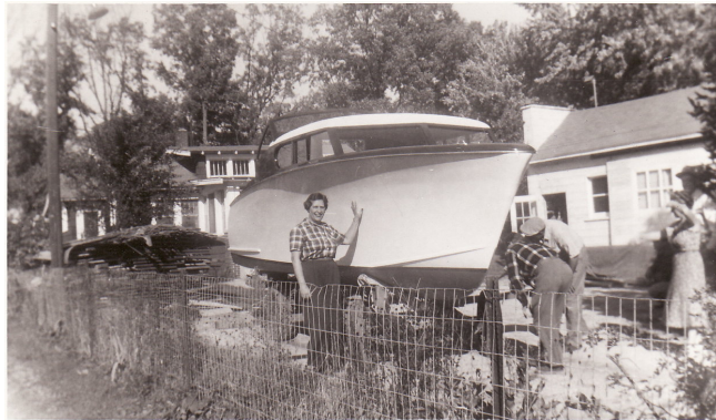
A new 1950's Streblow outboard cabin cruiser!